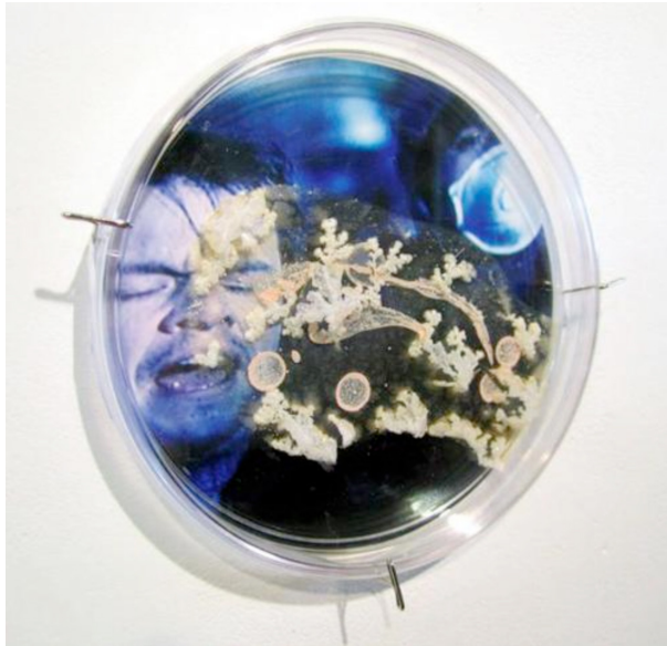
Image 3. Ambient Plagues (2013). I caught it at the movies . Bacterial growth and film still detail.